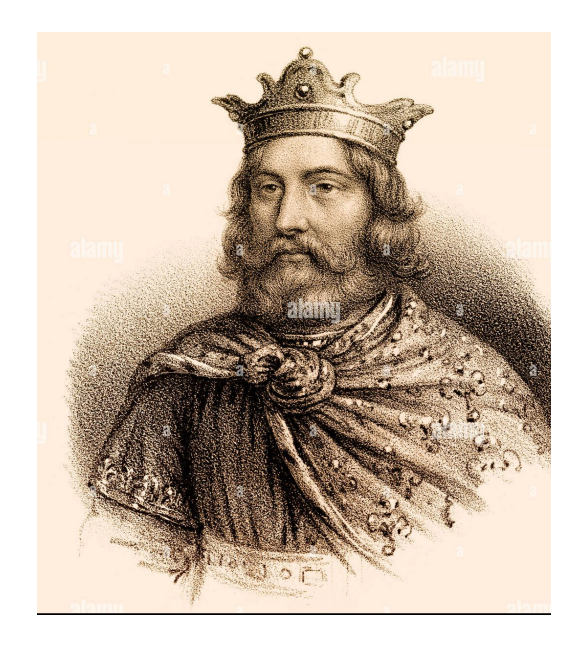
-The king had all the power - There was an no elective monarchy( no one could choose the king, it was from the family)